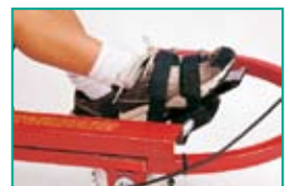
Foot Strap with Heel Support