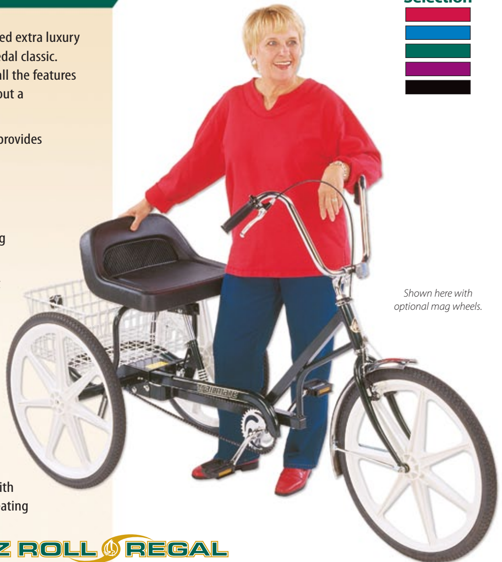
Shown here with optional mag wheels.