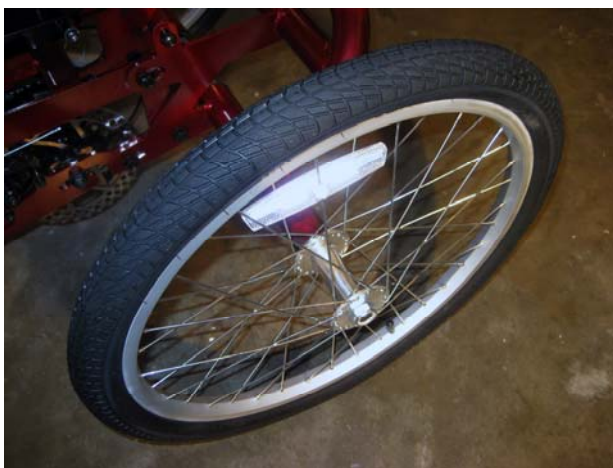
Rear wheel with locknut

Remove nylon locknut from rear axle and slide rear wheels onto the shaft aligning the key square with the slot on the hub.