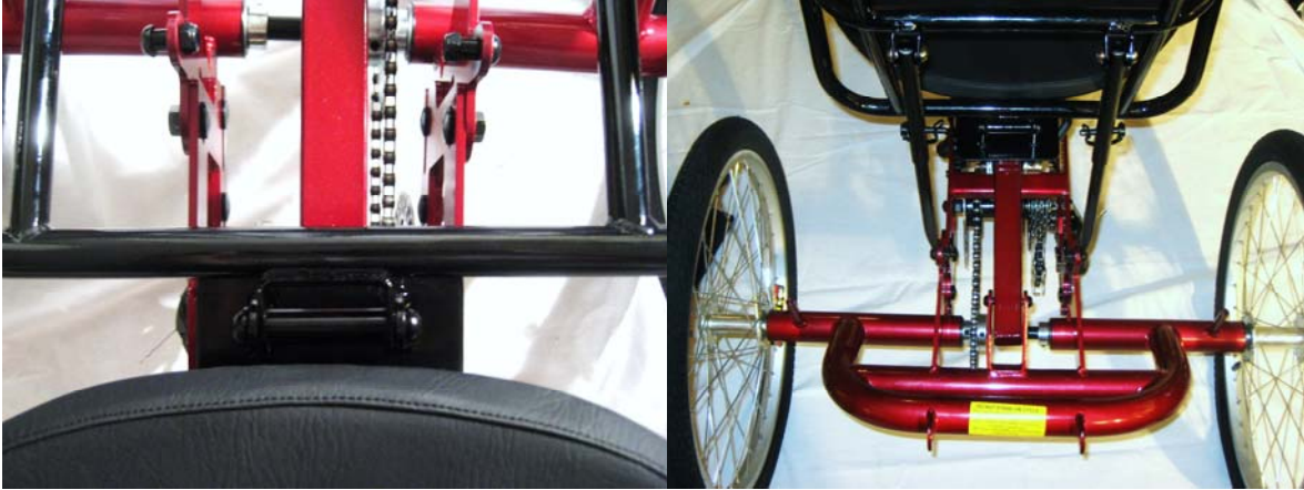
Center support for back rest

Attach main frame to the center bracket using Allen wrenches. Attach the adjustable braces to the rear bracket on the main frame and also to the back rest frame. Tighten bolts while ensuring that the frame can slide while the saddle seat is slid back and forth.