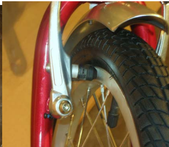
Front Brake shoe aligned