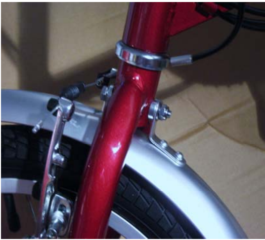
Front fender bracket

Attach the front fender to the front fork with the bracket on the back of the fork and the brace attached to the fork at the threaded hole. It may be necessary to loosen the brake shoes and then align them to the rim for proper contact.