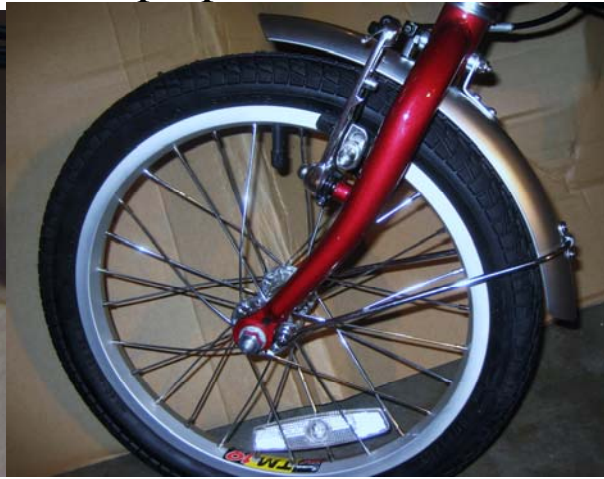
Front wheel with fender

Remove nylon locknut from rear axle and slide rear wheels onto the shaft aligning the key square with the slot on the hub.